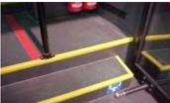
Bus door threshold