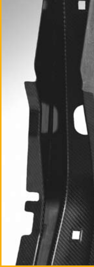
Composite, prepreg and laminating systems