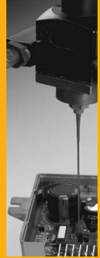
Casting resins for dielectrics