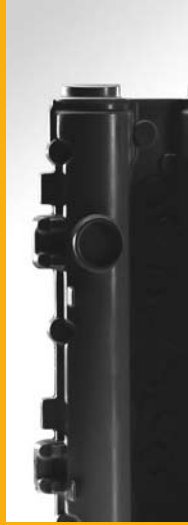
PU and EP resins