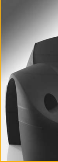
Block materials and model pastes